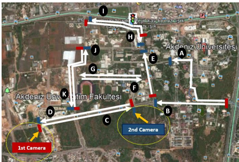
Figure 3 Average speed sections