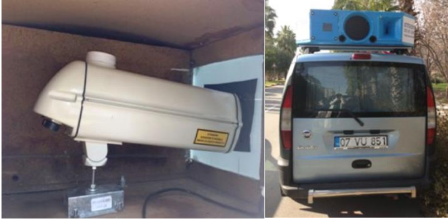
Figure 4 Automatic Number Plate Recognition setup placed on the vehicle [3,53].