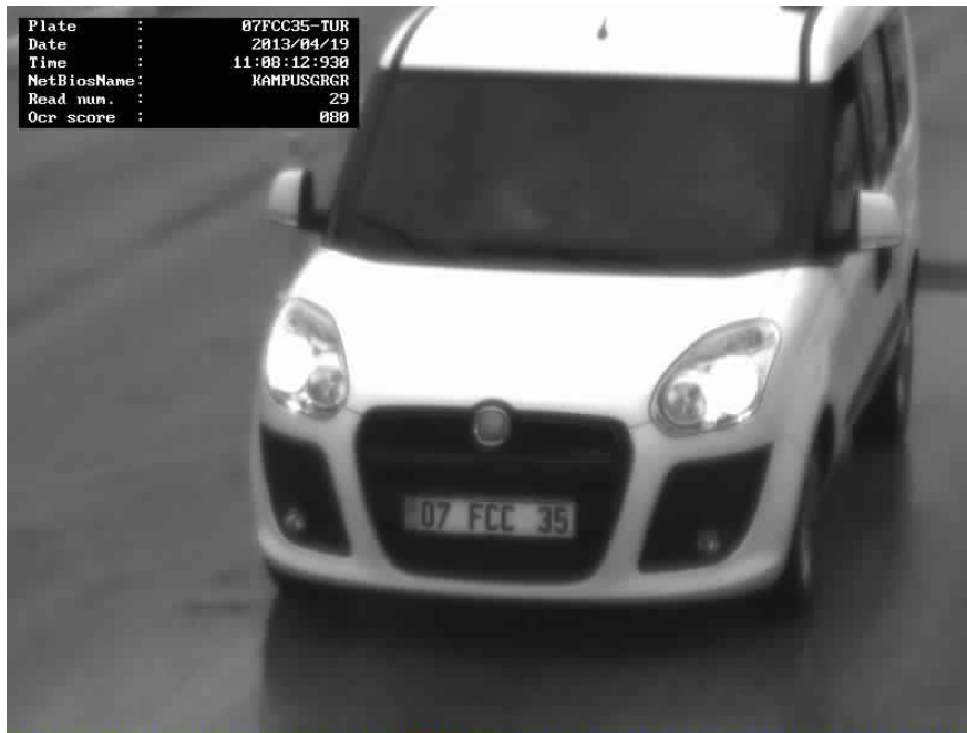
Figure 5 Vehicle example transferred as a photograph via 3G Router [3]