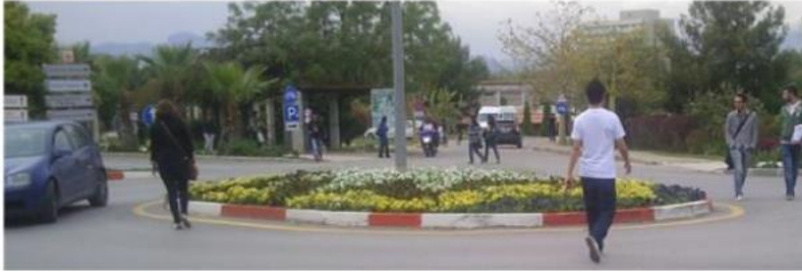
Figure 1 Pedestrians and vehicles in the same area